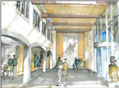
SOUTH CAMPUS ATRIUM

For a complete list of Naming Opportunities, go to FCchurch.com/REALIZE