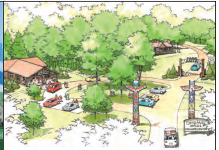
CAMP AKITA IMPROVEMENTS