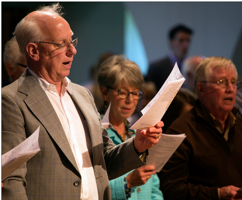
Parishoners enjoy the rich history of worship in song at First Community Church.

The Psalmist says, “Make a joyful noise to the Lord! Worship God in the beauty of holiness!”